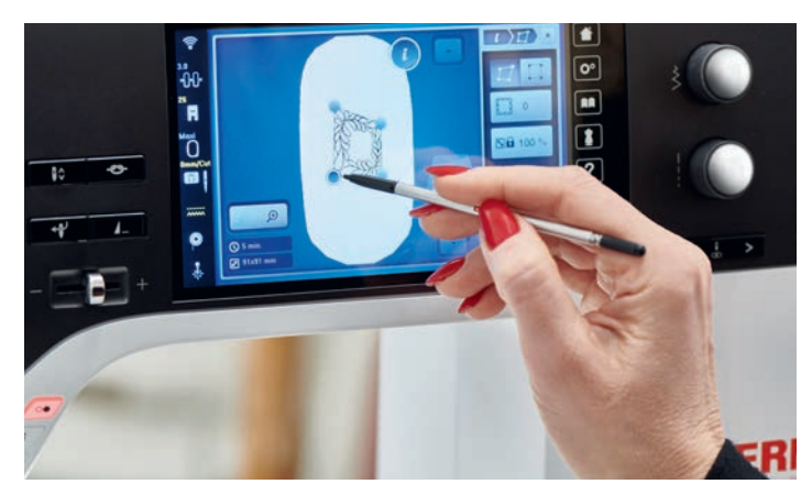
NEW 4-Point Placement with Morphing