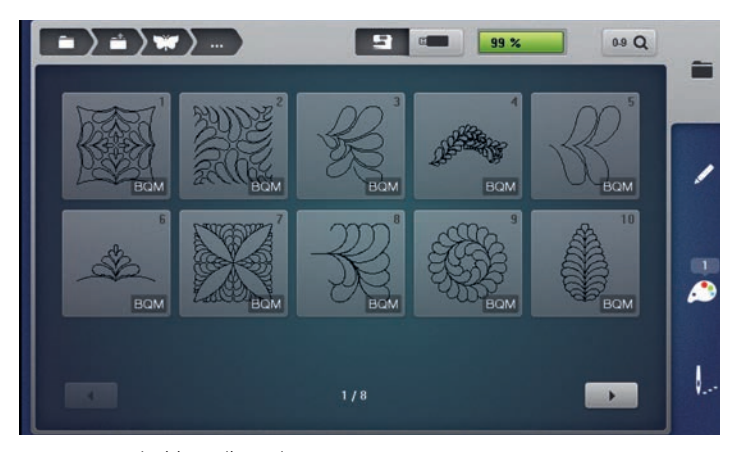
NEW Customizable Quilt Designs