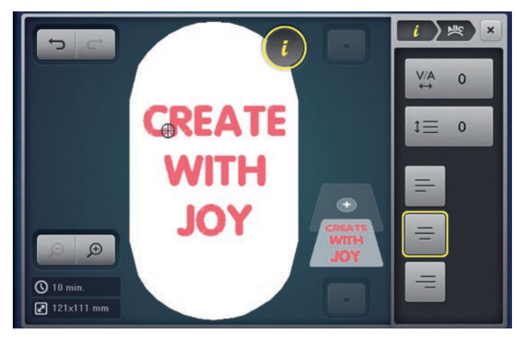
NEW Multi-line Lettering and Align