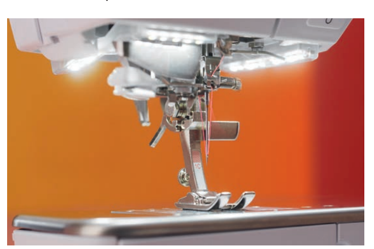
NEW Automatic Needle Threader